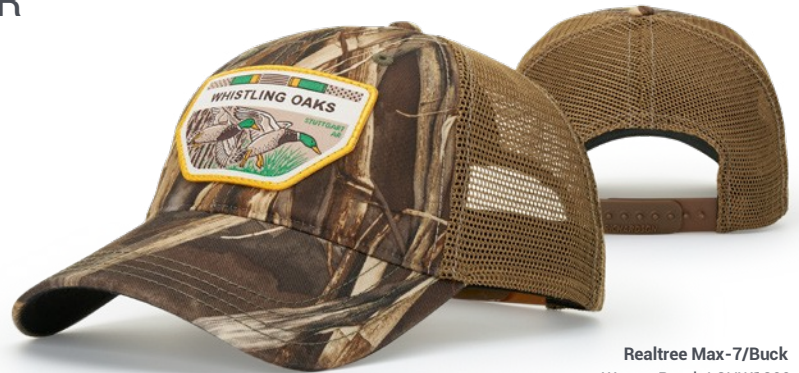
Realtree Max-7/Buck Woven Patch | CUW1300

Like the non-printed 111, the 111P is a remix of our famous 112 Trucker. A classic garment wash delivers an extra-casual look and comes in a variety of camo prints. The unstructured mesh back provides enhanced airflow for comfort while working in the yard or hunkering down in the blind.