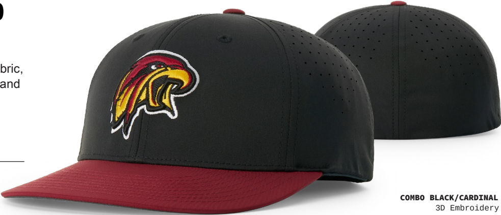
COMBO BLACK/CARDINAL 3D Embroidery

Constructed in a Mid Pro shape from our lightest-weight Ignite LT fabric, the PTS30 features laser-vented back panels for maximum comfort and breathability, available in four R-Flex sizes.