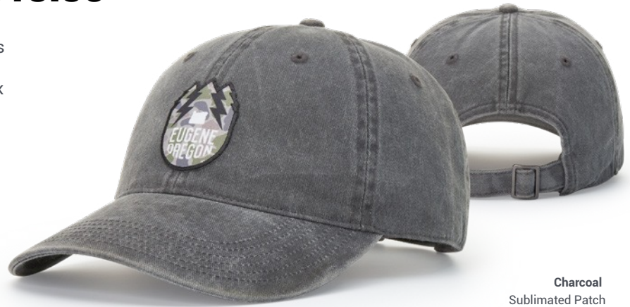
Charcoal Sublimated Patch

FIT: Adjustable CLOSURE: Cloth Hideaway Backstrap SIZE: OSFM