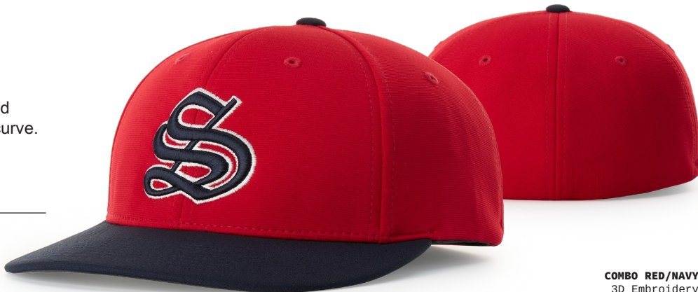
COMBO RED/NAVY 3D Embroidery

FABRIC: Pulse COMPOSITION: 98% Polyester/2% Spandex