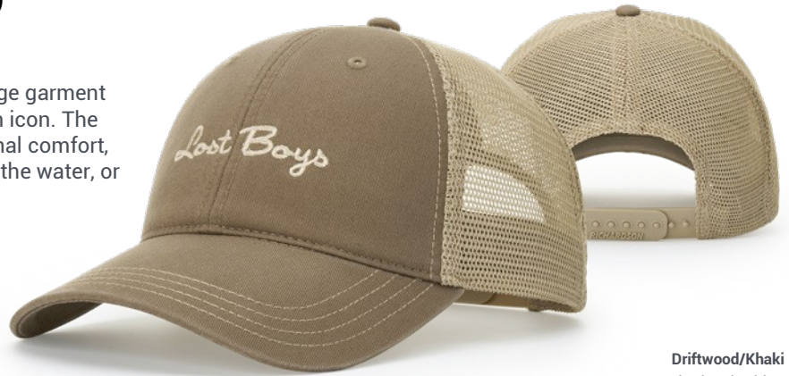
Driftwood/Khaki Standard Embroidery

This remix of our 112 Trucker is treated with a classic heritage garment wash for an extra-casual variation of the original Richardson icon. The unstructured mesh back offers a more relaxed fit for additional comfort, while the casual look is right at home in the driver's seat, on the water, or pulled over the eyes for an expertly executed afternoon nap.