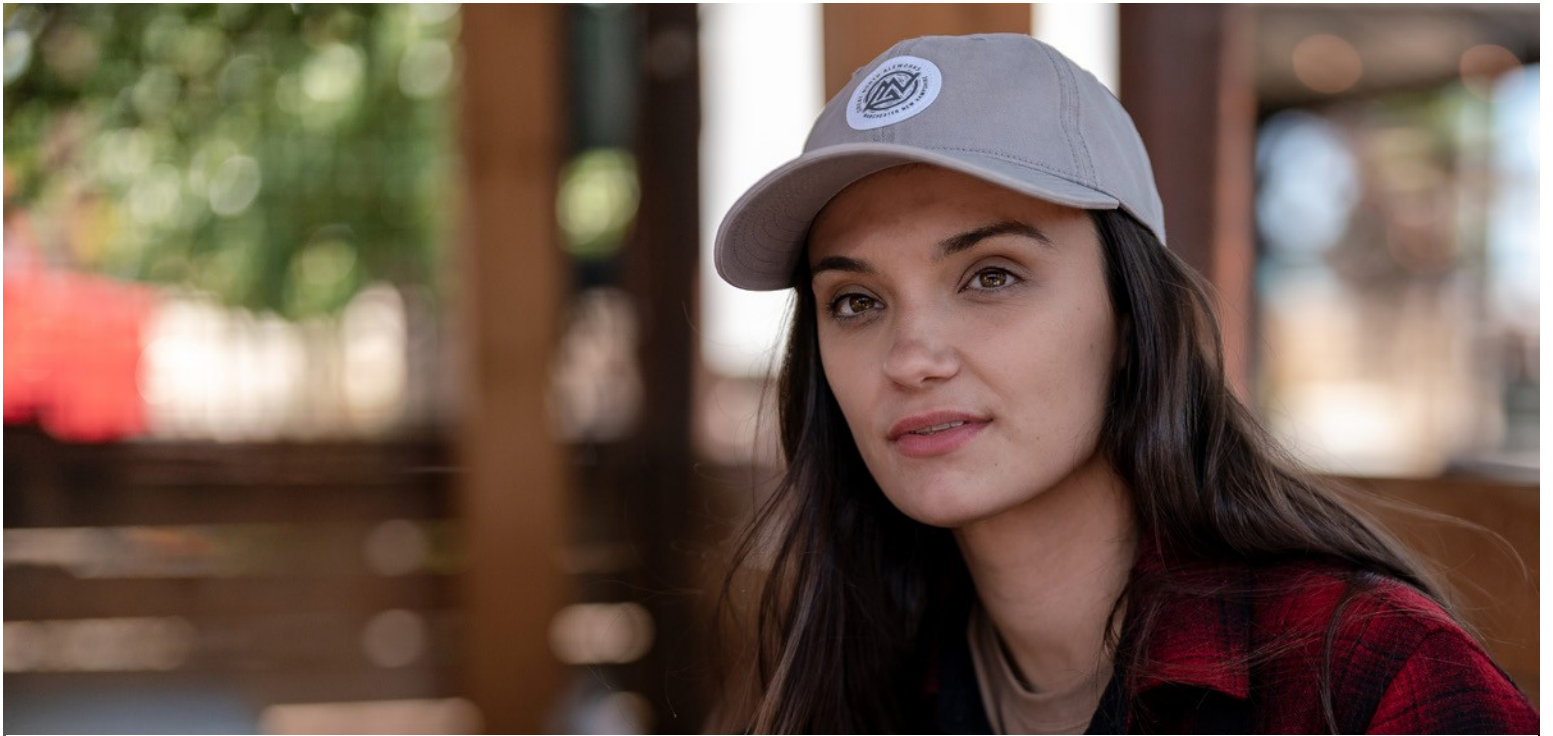
326 Grey Woven Label