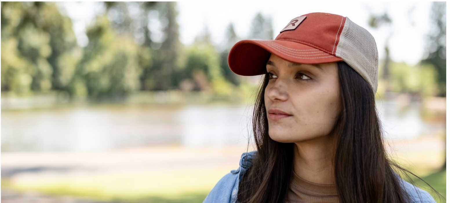
111 Texas Orange/Khaki Etched Genuine Leather Applique