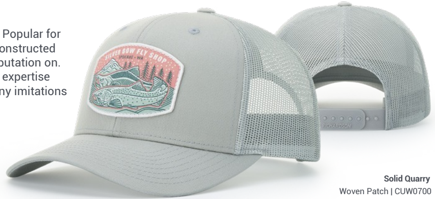
Solid Quarry Woven Patch | CUW0700

The 112 is the standard by which all truckers are measured. Popular for its undeniable quality and versatility, this casual classic is constructed with the trademark attention to detail that we've built our reputation on. With a design shaped by more than 50 years of cap-making expertise and available in over 50 colorways, the 112 has inspired many imitations yet continues to be the most popular cap in the USA.