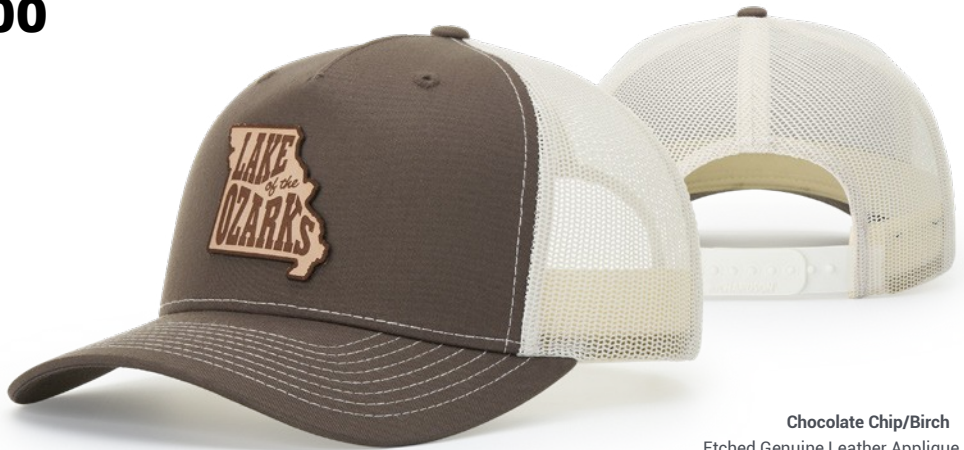
Chocolate Chip/Birch Etched Genuine Leather Applique

FIT: Adjustable CLOSURE: Snapback SIZE: OSFM