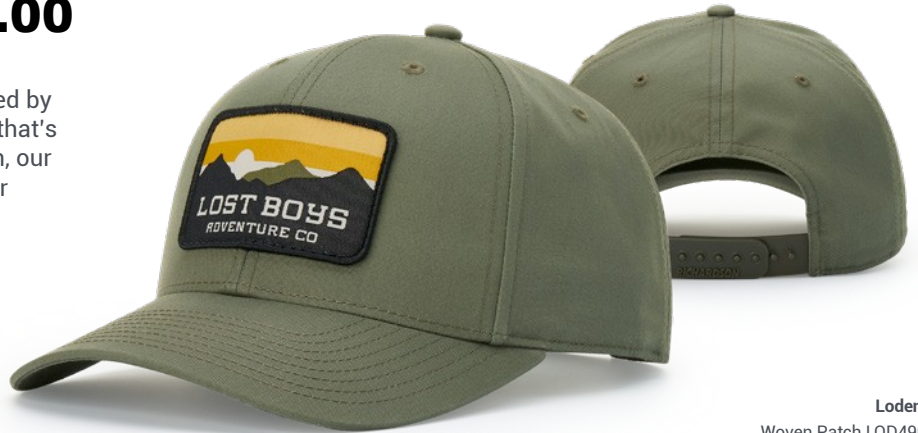
Loden Woven Patch | OD490

FIT: Adjustable CLOSURE: Snapback SIZE: OSFM