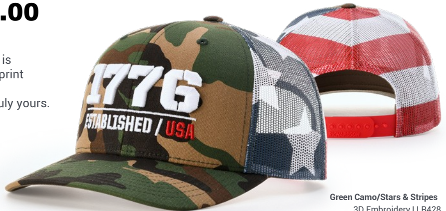
Green Camo/Stars & Stripes 3D Embroidery | LR428

FIT: Adjustable CLOSURE: Snapback SIZE: OSFM