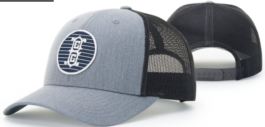
Heather Grey/Dark Charcoal Woven Patch w/ Embroidery | GF827

FIT: Adjustable CLOSURE: Snapback SIZE: SM (6 1/2- 7 1/4)