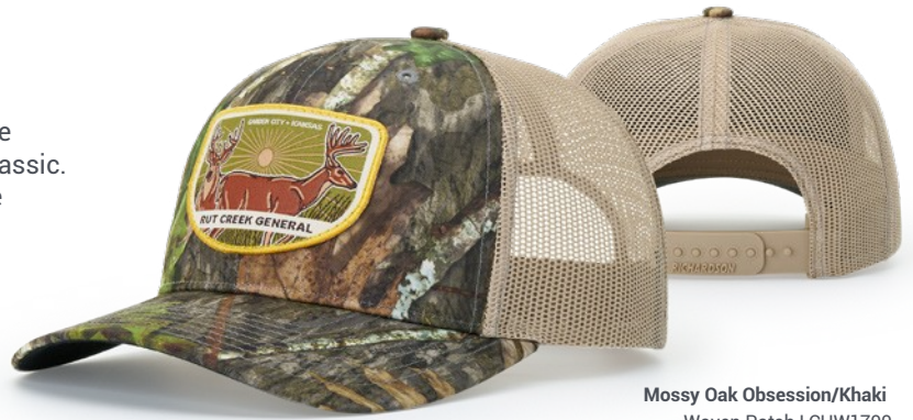
Mossy Oak Obsession/Khaki Woven Patch | CUW1700

The iconic design of our famous 112 Trucker gets a redesign for the great outdoors with this printed reimagining of the Richardson classic. A mesh back provides the best in ventilation and comfort, while the 112P's adjustable snapback allows you to lock in your perfect fit.